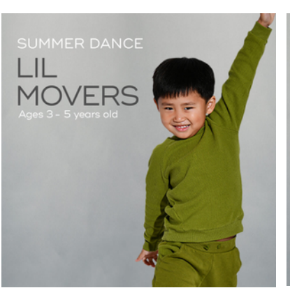
July 25 - August 17