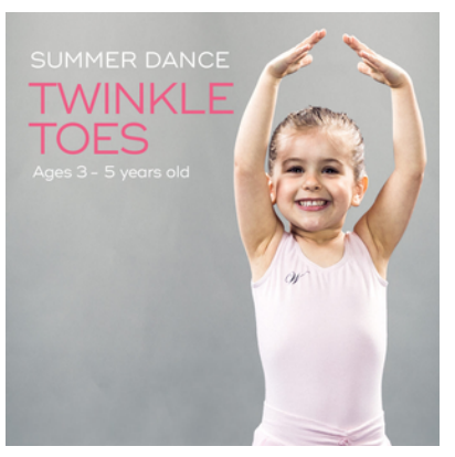
July 25 - August 17