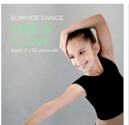
August 8 - 11