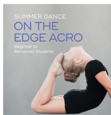
August 15 - 17